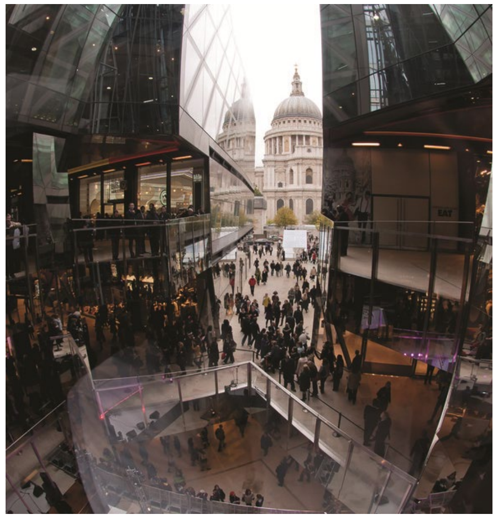
Mixed use : One New Change, London, combines retail, office space and a rooftop viewing gallery

The Arup building retrofit team has a unique set of skills and a wealth of project experience in transforming poorly performing existing buildings into energy-efficient, high-performing spaces. Retail premises, location, transport modes and delivery models need to keep pace with retailers and consumers, whose requirements are evolving to embrace a surge in consumer demand for more sustainable and ethical products.