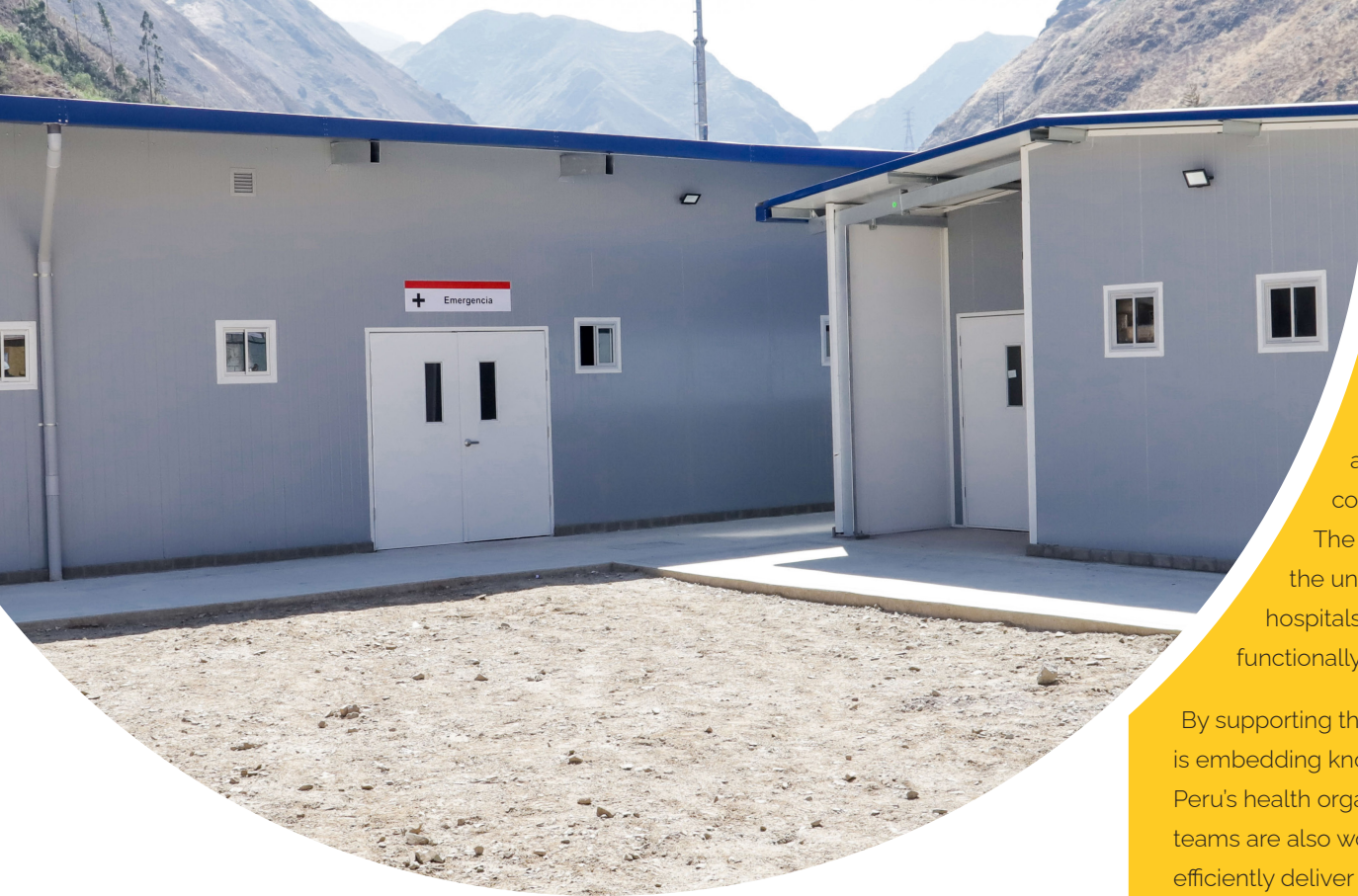
Temporary hospital in Matucana built in half the usual time