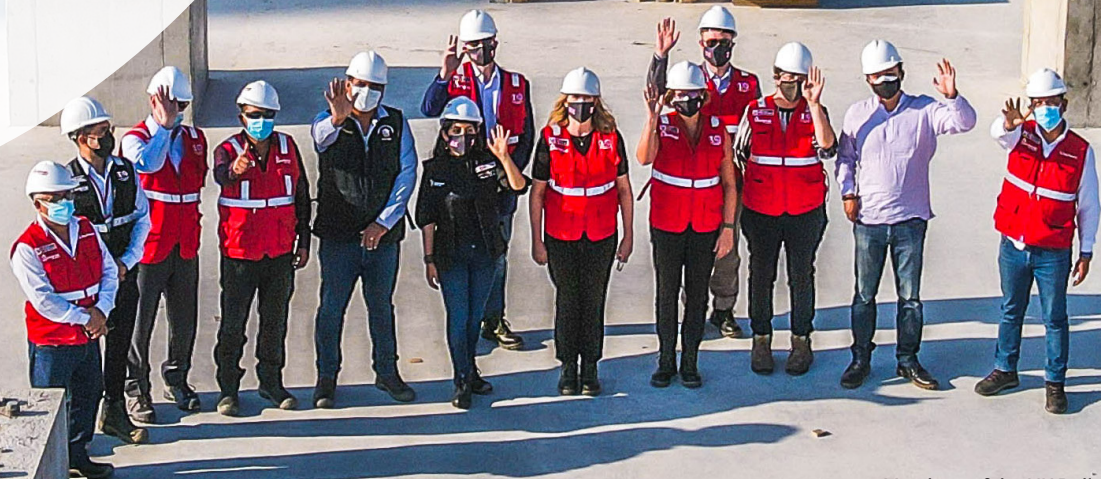
Members of the UK Delivery Team, ARCC and the UK government at the site of the Sullana hospital

Executive Director, Autoridad para la Reconstrucción con Cambios