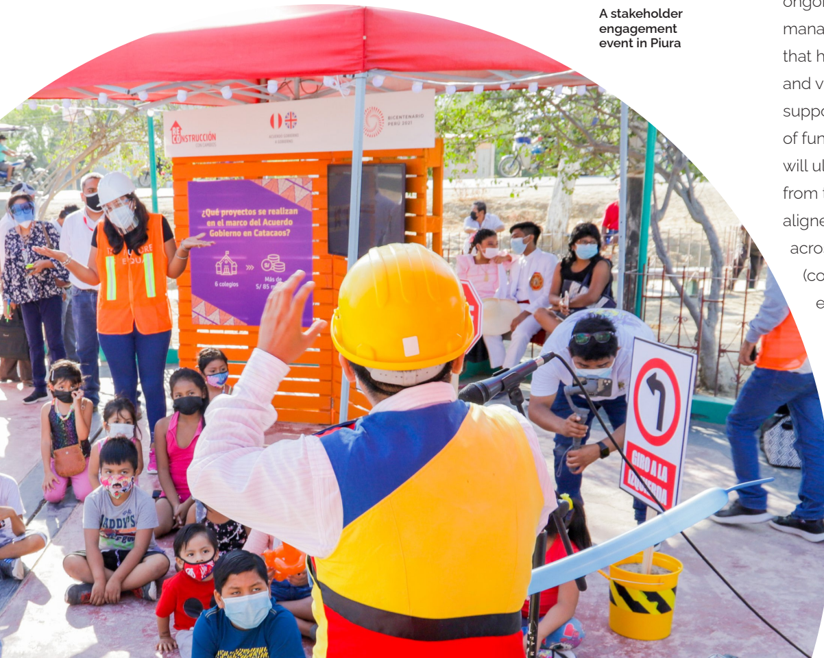
A stakeholder engagement event in Piura

The UKDT has worked closely with the ARCC to implement 'Good Neighbour Plans' with all contractors working on the programme. Each contractor is given guidance on how to draft their plan, which sets out how they will work with local communities and how they will keep them informed about the projects in their area, so that the local communities can go about their daily lives with the least amount of disruption. The ARCC, with support from the UKDT, reviews and approves all Good Neighbour Plans, which are then implemented across all the live projects that make up the G2G.