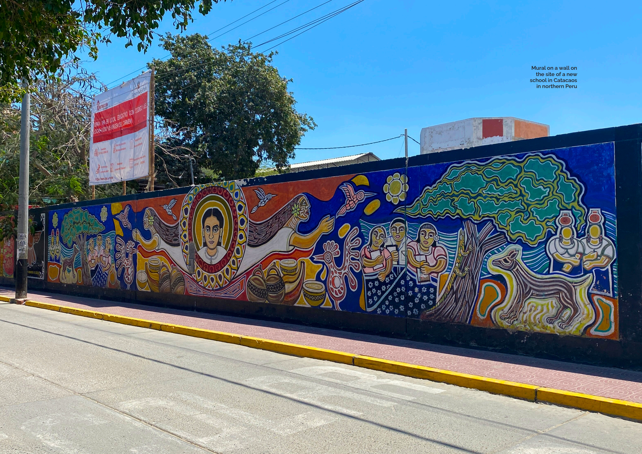
Mural on a wall on the site of a new school in Catacaos in northern Peru