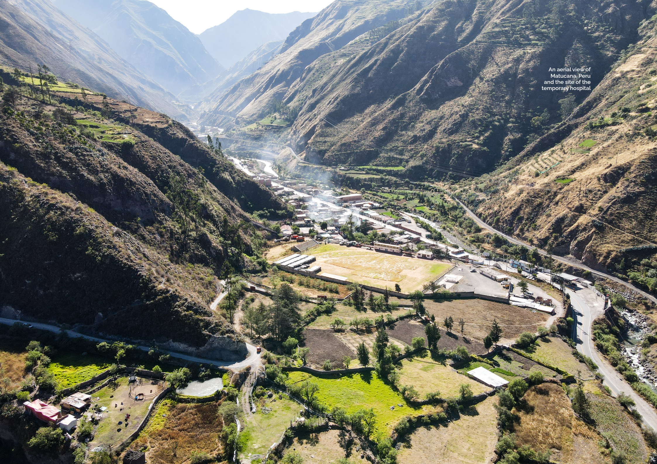
An aerial view of Matucana, Peru and the site of the temporary hospital